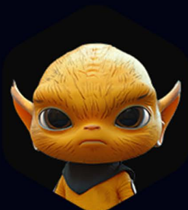
ORION OVERDRIVE CTO