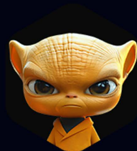
COSMOS CRUNCH CFO