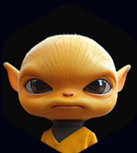
CAPTAIN COSMOS CEO

JOIN THE SCOTTY CASH CREW AND EXPERIENCE THE FUTURE OF CRYPTO REWARDS. HOLD $SCOTTY, EARN REWARDS, AND LET'S BEAM OUR WAY TO A BRIGHTER CRYPTO GALAXY!